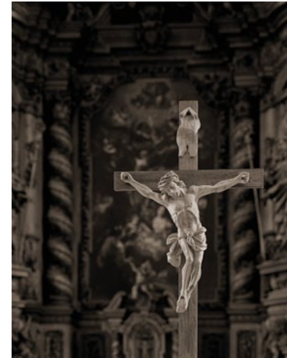
Church of St. Nicholas, Louny , 2001