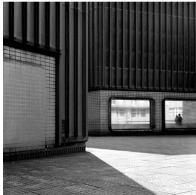
I'm not going to Ještěd anymore, Liberec , 2002