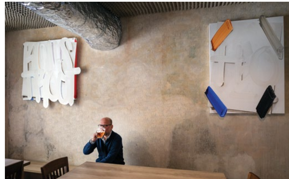
from the series Exhibitions and Situations, Liberec , 2019