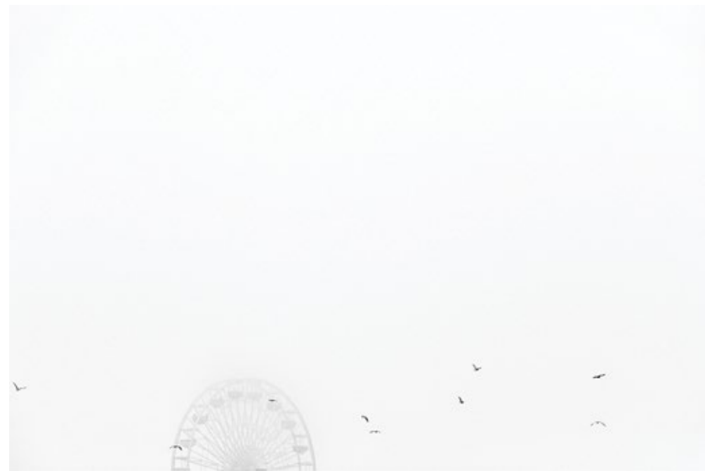
Santa Monica Pier, California, 2013 Endowment Fund D. A. D. A