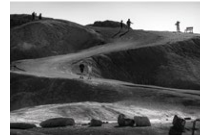
Zabriskie Point - California, 2013