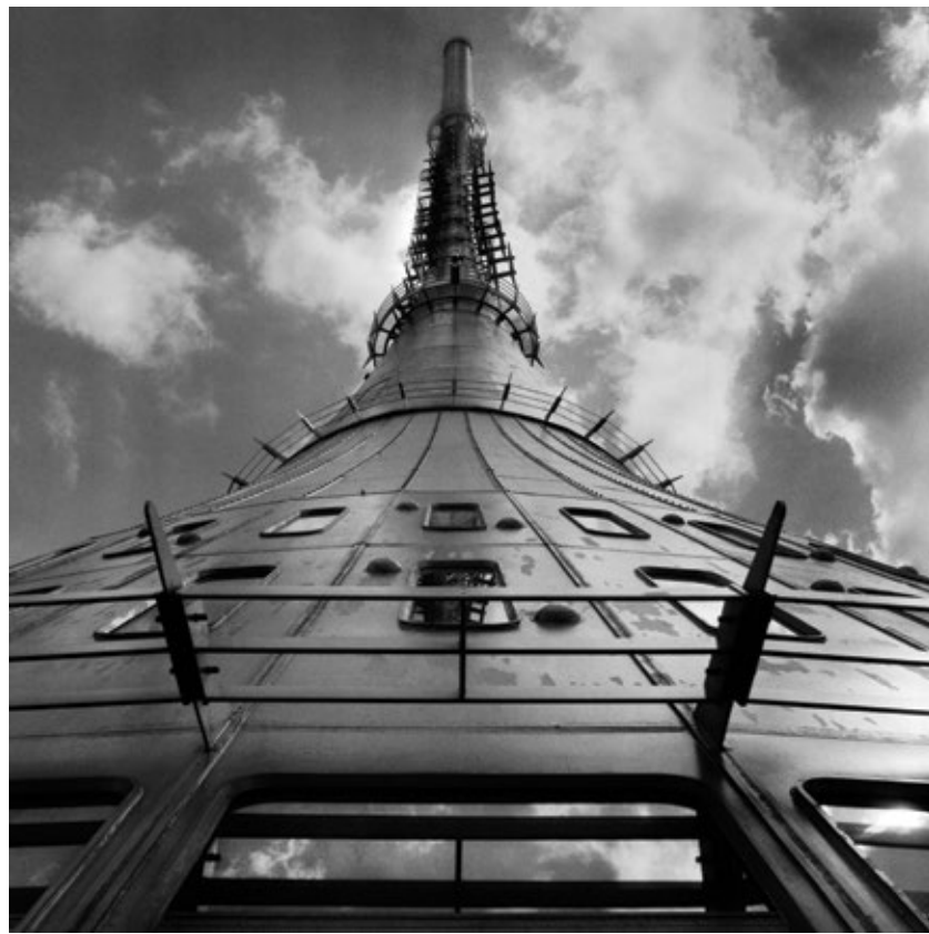
The Ještěd Phenomenon, Liberec , 2001