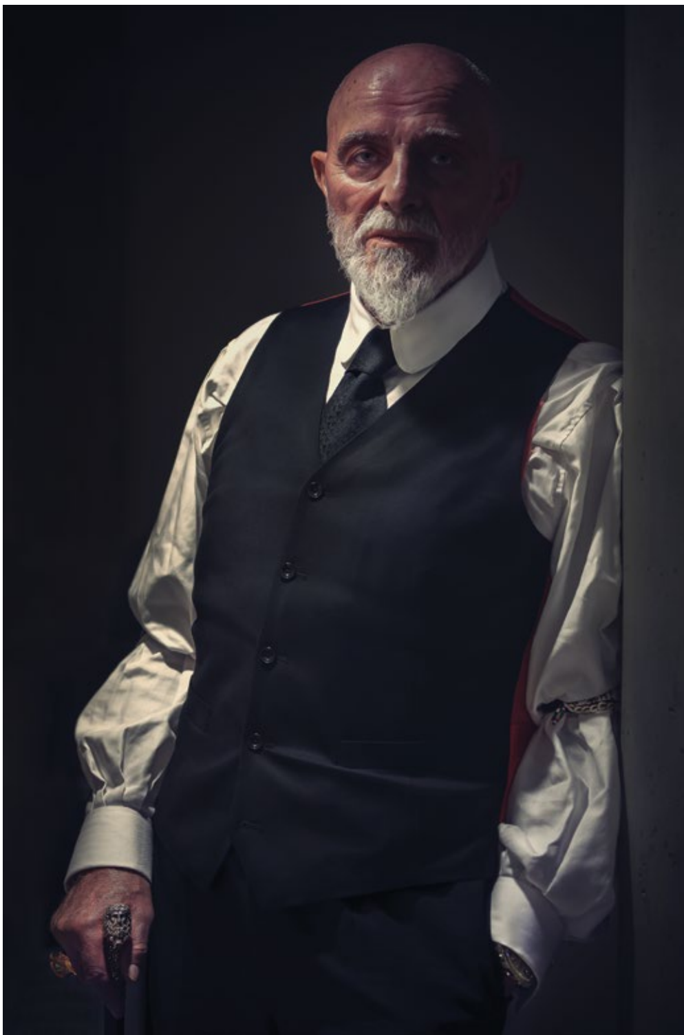
Markus Lüpertz, Liberec , 2016